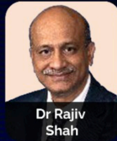
Dr Rajiv Shah