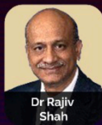
Dr. Rajiv Shah